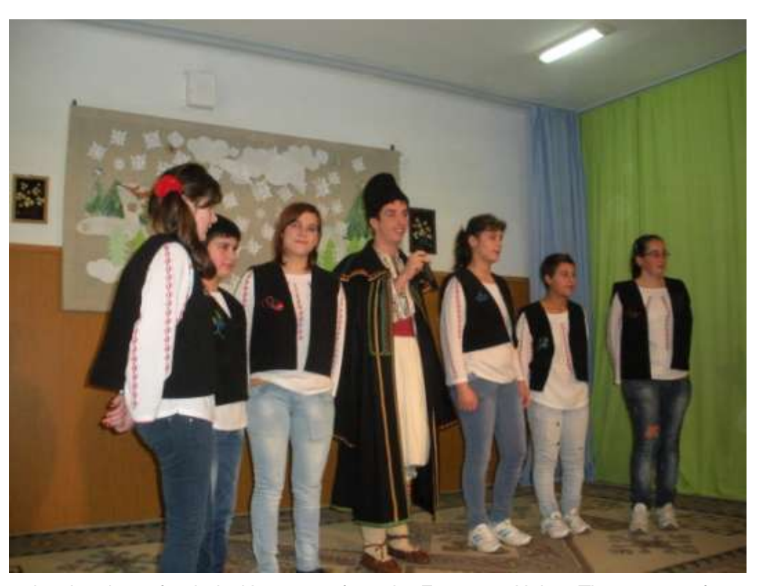
This project has been funded with support from the European Union. The content of publications (communication) reflects the views only author. Publication (communication) no reflects the views of the European Commission and the European Commission is not responsible for any use which are contained therein.